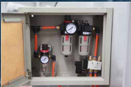
Pneumatic Control Panel