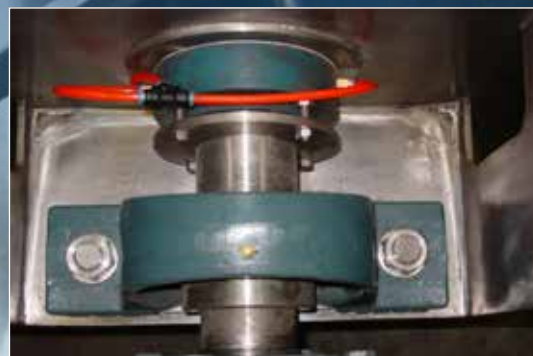
Main Shaft Seal & Bearing