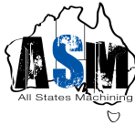
All State Machining