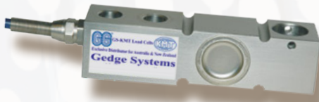
GSAGX Shear Beam Load Cell