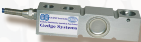
GS-AGX-1 Shear Beam Load Cell