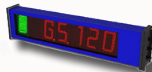
GS120 Large Display