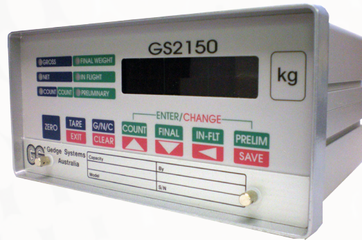
GS2150 Single Ingredient Self Contained FILL Controller for Bags, Boxes, Bottles